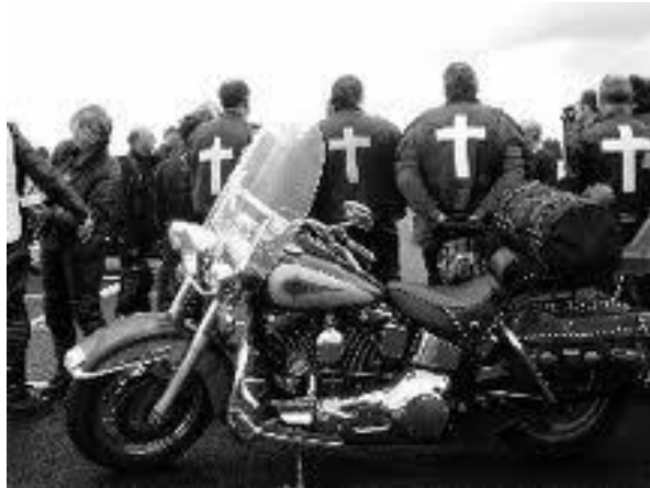
Picture taken from the internet of Christian Bikers