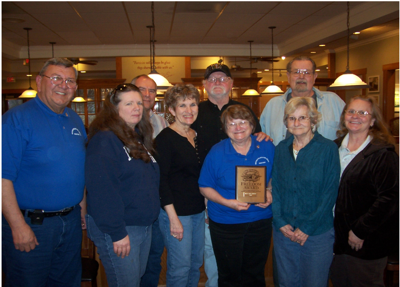
At the ABATE District Meeting at the beginning of April the New Life Riders were pleasantly surprised to receive ABATE's Freedom Award for the second year in a row. This award was presented to the New Life Riders TEAM for their charity work, dedication and service to Indiana motorcyclists.