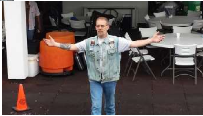
THE RAIN HAS STOPPED!