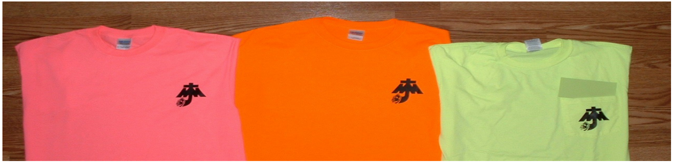
Bright Safety Pink, Orange and Green T-shirts with MJM printed on the front!

Note : During the month of December All Goodies Apparel is discounted 20%